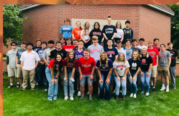
Graduating class of 2021 who had all committed to colleges, 11 of those also are playing sports.