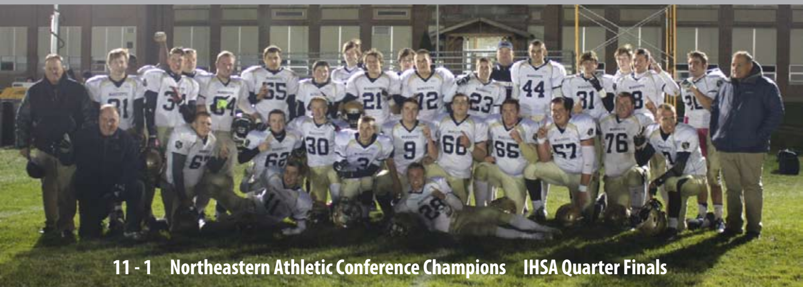
11 - 1 Northeastern Athletic Conference Champions IHSA Quarter Finals