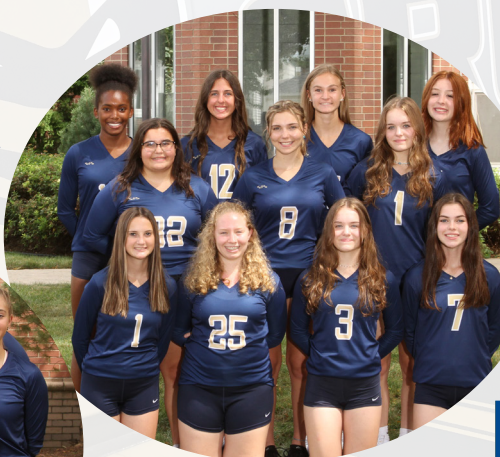
Sophomore: Cumulative 3.76