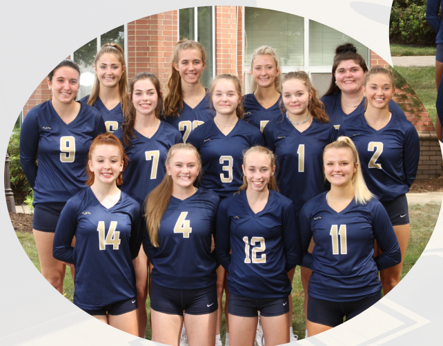
Varsity: Cumulative 3.89

Marquette Academy Volleyball teams combined had an average GPA of 3.8. The majority are also multiple sport athletes, and involved in clubs and organizations. When students feel like they're involved in a skill or environment they're getting better at, and when they feel like there's a purpose to what they're doing, they come to understand that their efforts contribute to the greater good. Success is contagious, and we are proud of all our students and their accomplishments at every level!