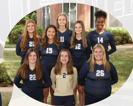
Freshman: Cumulative 3.77