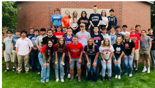
The Class of 2021 sporting their T-shirts on College Commitment Day. Not only did we have 35 students attend a 4-year college, 11 of them are also participating in college level athletics.